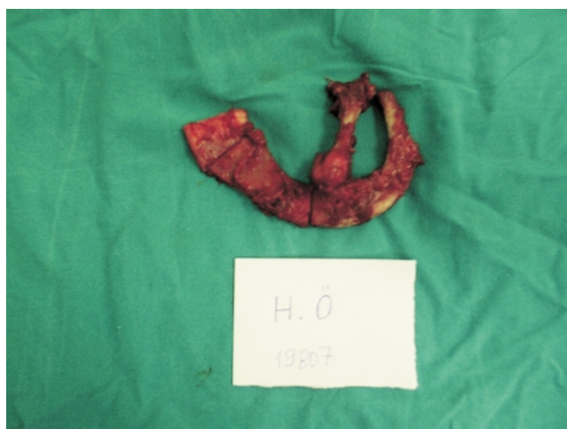
Fig. 2. The resection of the cervical rib with the first-rib.

Our patients had pain and numbness in various locations for the first 2 months postoperatively in their long term follow-up. Elevation of the scapula was observed in two cases around the 15th postoperative day. In our further observations this problem also resolved. In the second two monthly period no serious complaints were noted. About 20 cases could be followed for approximately 5 years.