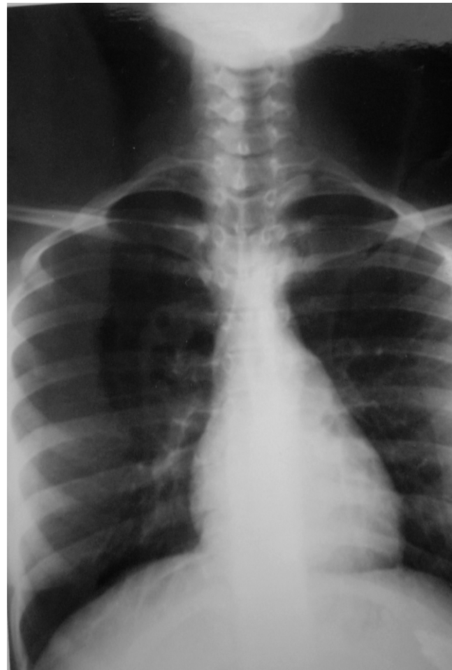
Fig. 1. The X-ray of the patient with a cervical rib.

Twenty-six of the cases were females (75%) and nine were males (25%). To 35 patients whose mean ages were 25 \pm 1 (17–40 years) a total number of 40 operations were performed. The most important symptom was localized pain (being in multiple sites in 60% of cases) 90% in the arm, 50% in the neck, 30% in the shoulder, and 20% in the head. In 20% of cases fatigue of the arm, in 30% coldness, in 10% atrophy, and in 20% cyanosis were present. In 30% of our cases (85%) paresthesia was present; 70% of these were in the ulnar nerve region (C8–T1) and 15% were in the median nerve region (C5–C7). In almost 90% of our patients the Adson's test, costoclavicular test, AER and the hyperabduction test were positive. There were no pathologies in the routine blood and biochemical tests. The EMG test results were consistent with TOS in only 65% of our cases. The preoperative EMG average values of our cases were found to be 56.71 m/s. The postoperative control EMG values were 65.19 m/s. Postoperative EMG values were significantly higher than the preoperative EMG values ( p < 0.001 ). In the venous and arterial doppler ultrasonographic examinations